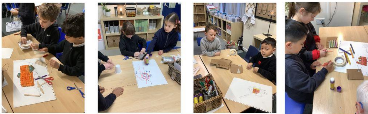
Making our rafts