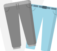
3 x Trousers (Ideally not jeans)