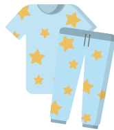
1 x Set of pyjamas