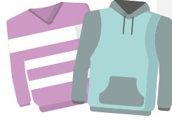
3 x Long Sleeve Tops (Jumpers/Hoodies etc)