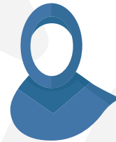
1 x spare Head Scarf (if you wear one)