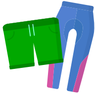
2 x Pair of shorts (knee length) (or leggings that can get wet)