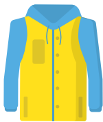
1 x Coat - ideally waterproof (For walking to centre)