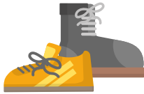
2 x Pairs of trainers