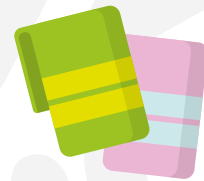
2 x Towels