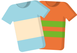
3 x T-Shirts (No vests or crop tops please)

(This list includes what you'll wear to Robinwood)